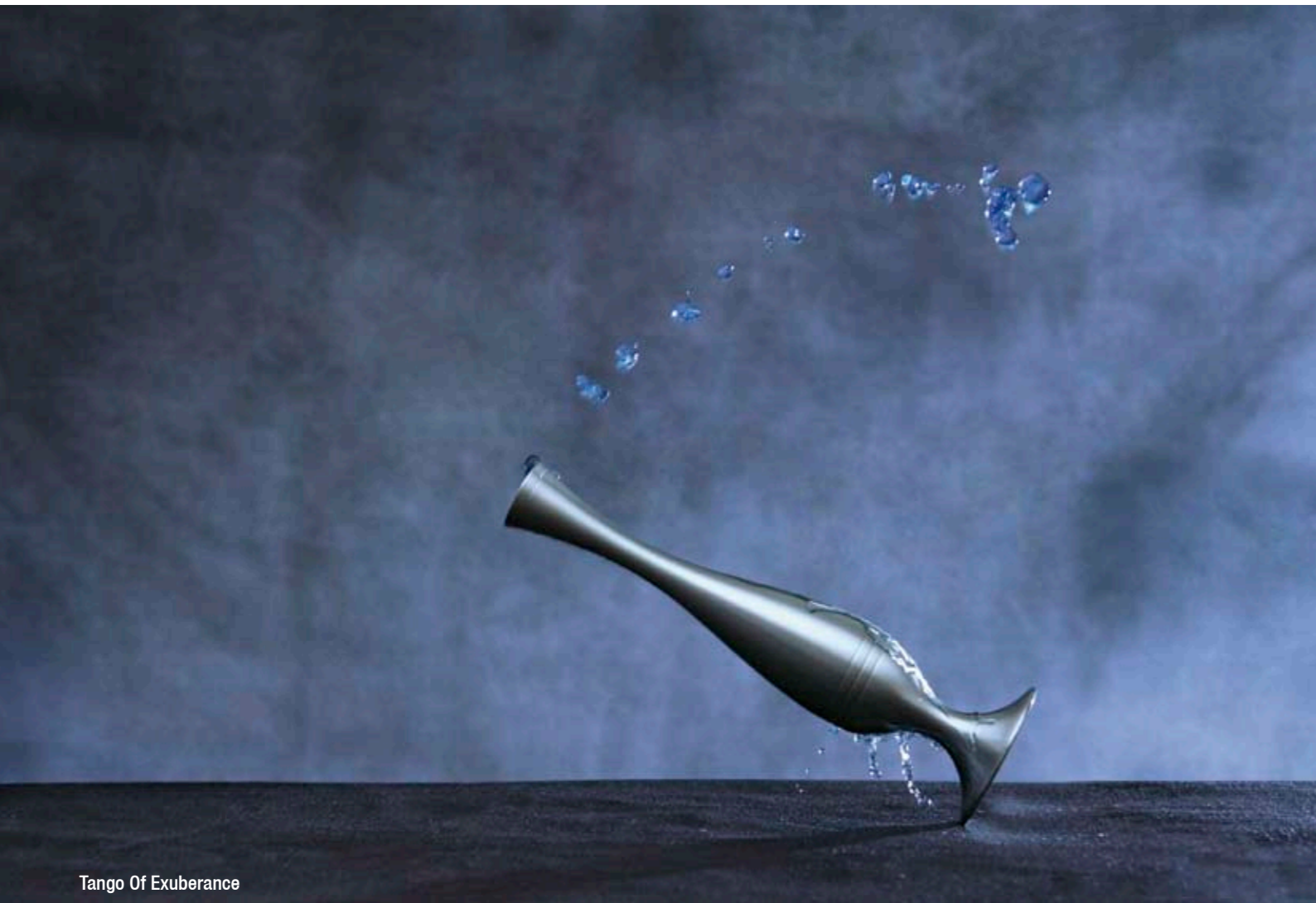
Tango Of Exuberance